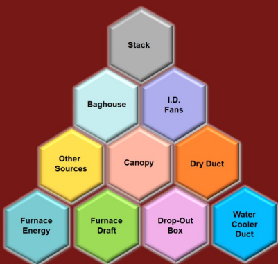
RPM's List of Modules for a Typical Steelmaking Operation